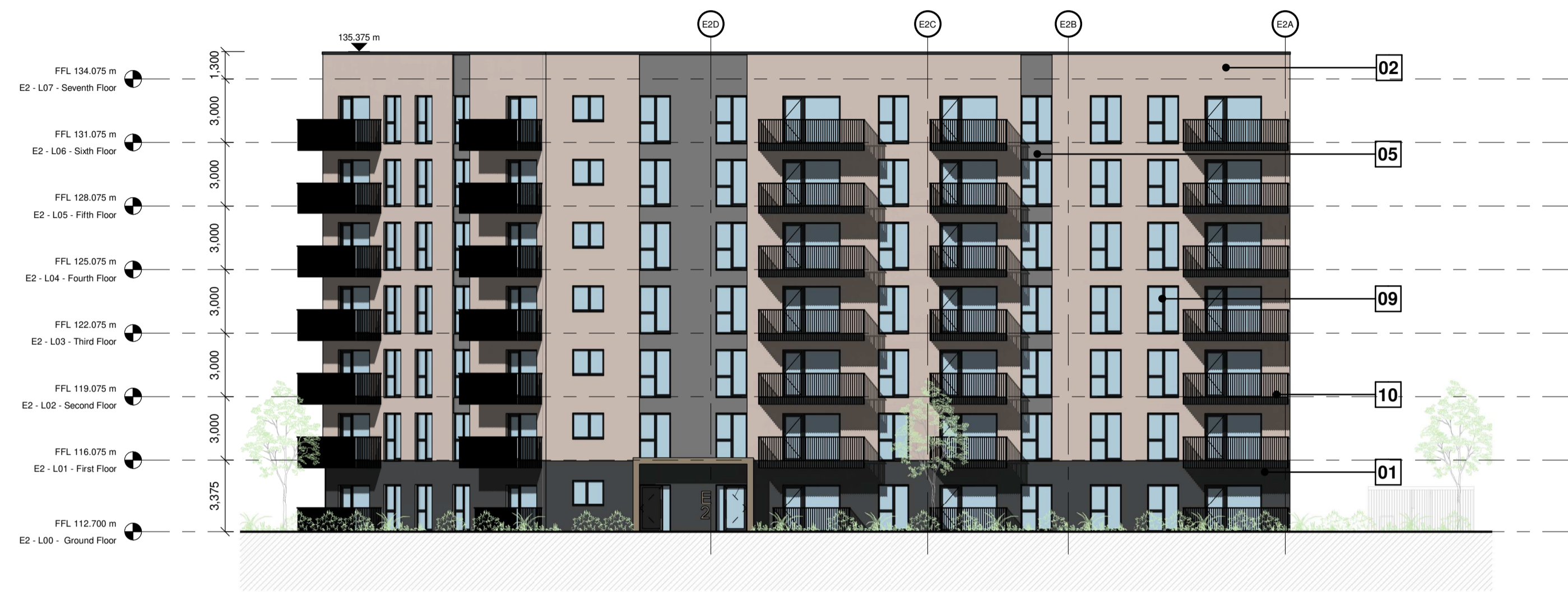
1 PROPOSED ELEVATION - BLOCK E2 - SOUTH-EAST (STREET) 1 : 200