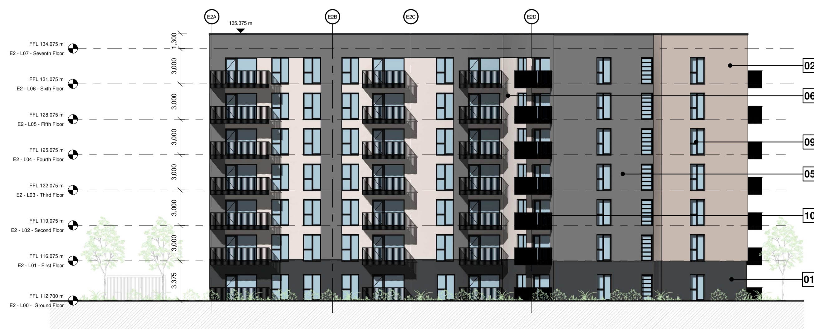
3 PROPOSED ELEVATION - BLOCK E2 - North West 1 : 200