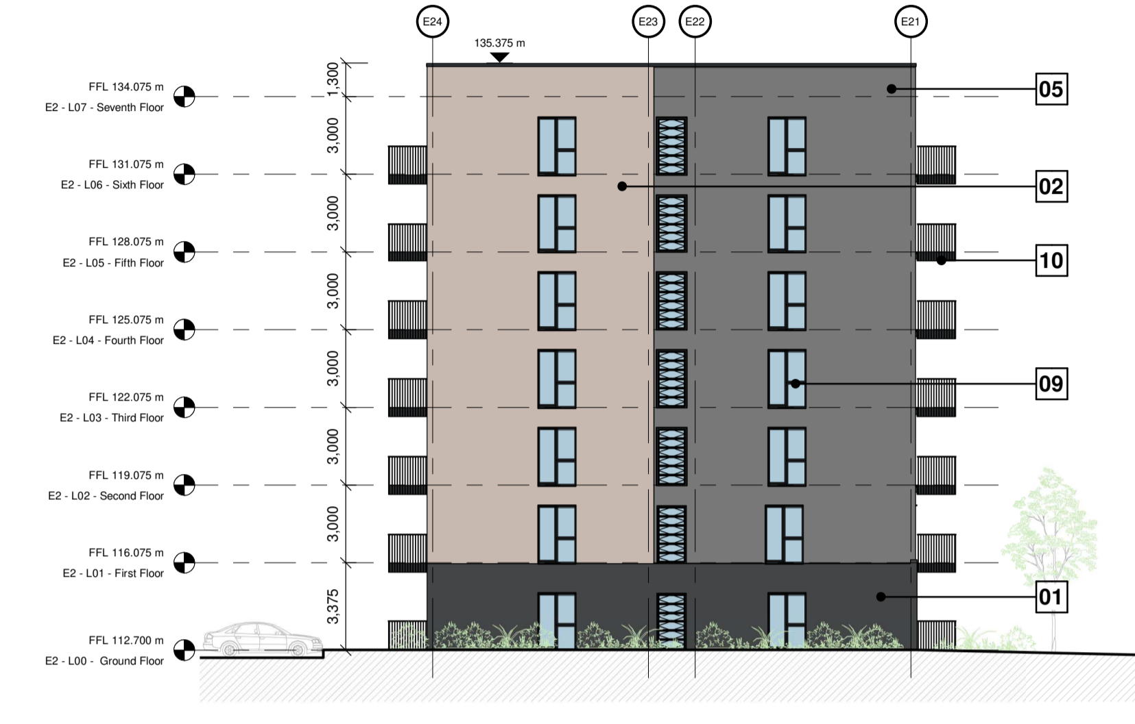
2 PROPOSED ELEVATION - BLOCK E2 - North-EAST 1 : 200