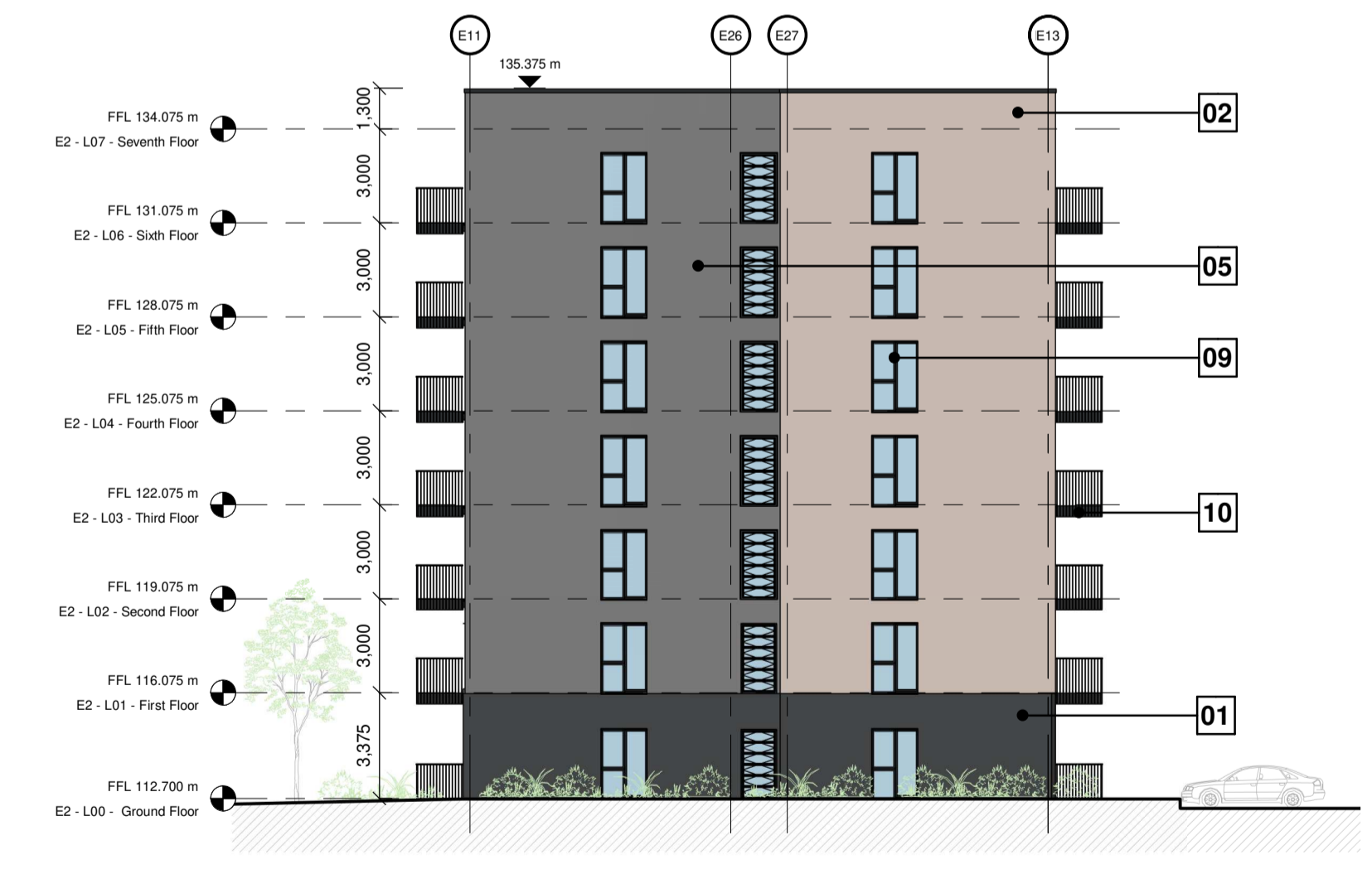
4 PROPOSED ELEVATION - BLOCK E2 - West 1 : 200

Notes: - Do not scale from this drawing. Use figured dimensions in all cases. - Verify dimensions on site and report any discrepancies to the Architect immediately. - This drawing is to be read in conjunction with the Architect's Specification. - © This drawing is copyright and may only be reproduced with the Architect's permission.